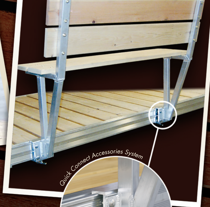
Quick Connect Accessories System